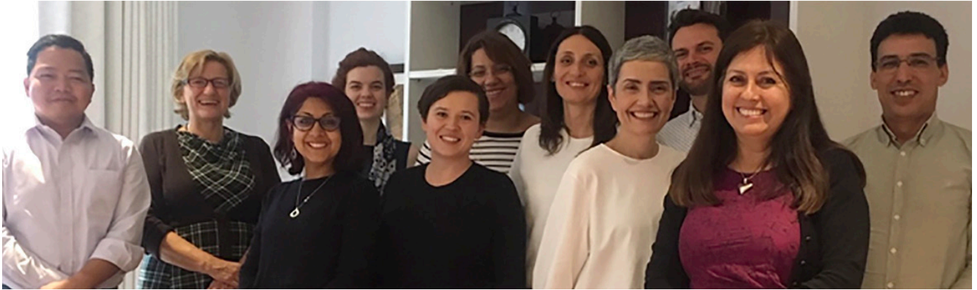
Movement Accelerator meeting. London 3-5 October 2019